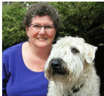
Elaine and Hobbes