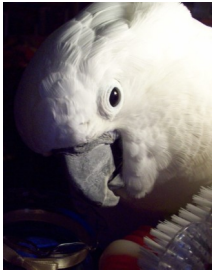
Cuddles - Seizures