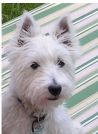
Oliver - Fear