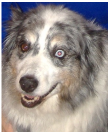
Jackson - Lick Granuloma