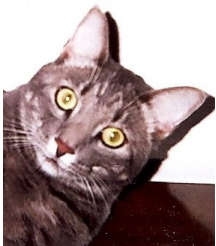
Goofy - Spraying