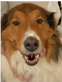
Bridget - Nervous